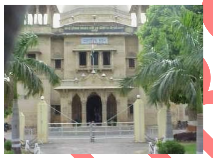
C.S.A.U Agriculture College